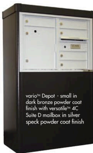
vario™ Depot - small in dark bronze powder coat finish with versatile™ 4C Suite D mailbox in silver speck powder coat finish